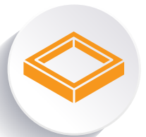
FORM AND POUR